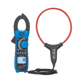
TNP477 Heavy-Duty True RMS Clamp Meter with Bluetooth and Flex Probe